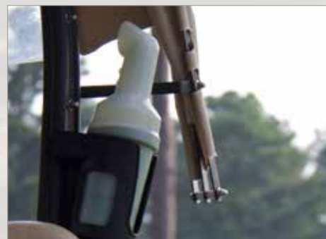
Divot Repair Sand Bottle