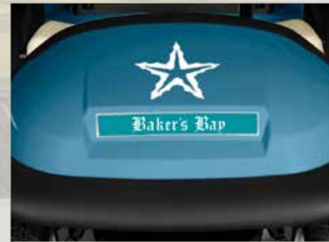
Custom Course Logo