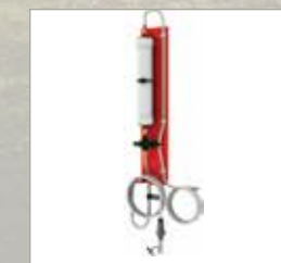
Water Deionizer for Single Point Watering System