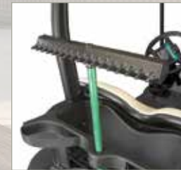
Sand Trap Rake Kit