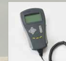
IQ Display Module