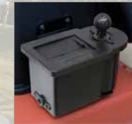
Ball and Club Cleaner