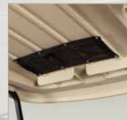
Canopy Storage Net