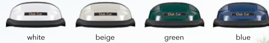
white beige green blue