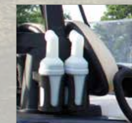
Dual Sand Bottle