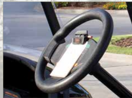
Soft-grip Steering Wheel

Standing out is fundamental to marketing your brand. Club Car® is here to help. With available ergonomic, aesthetic and functional options, the possibilities are almost endless to create a standout car for your course and customer.