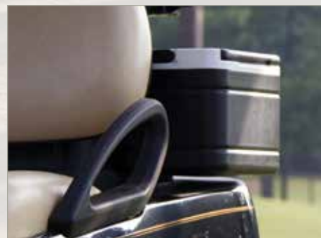
Caddy Master Cooler