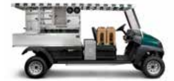
CAFÉ EXPRESS SE