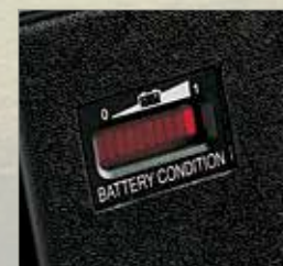
Battery Capacity Meter