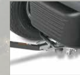
Deluxe Towing Package